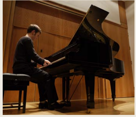
Frequent music recitals only really became possible once the Mary Ogilvie Lecture Theatre had been built.

over which College had no control) under financial imperatives and at the mercy of increasingly invasive government policy initiatives. The worst fears about outcomes from the Dearing Report (1997) on higher education and its likely assault on the "Oxbridge premium", otherwise known as the "college fee", were not exactly realised in that the withdrawal of the premium was phased, but the downward slide of public funding for Oxford and all British universities has been and continues to be inexorable. Another change with which Oxford tutors were grappling at this time was the virtual disappearance of the