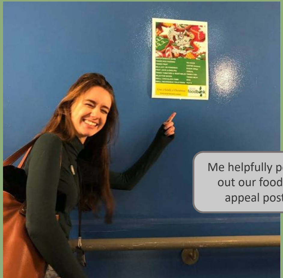
Me helpfully pointing out our foodbank appeal posters

I've been involved in volunteering/fundraising a lot at home and really enjoy it. As stuff gets back to normal, I want to help create opportunities for that here at Anne's.