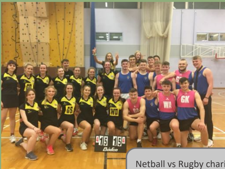
Netball vs Rugby charity netball match for the British Heart Foundation