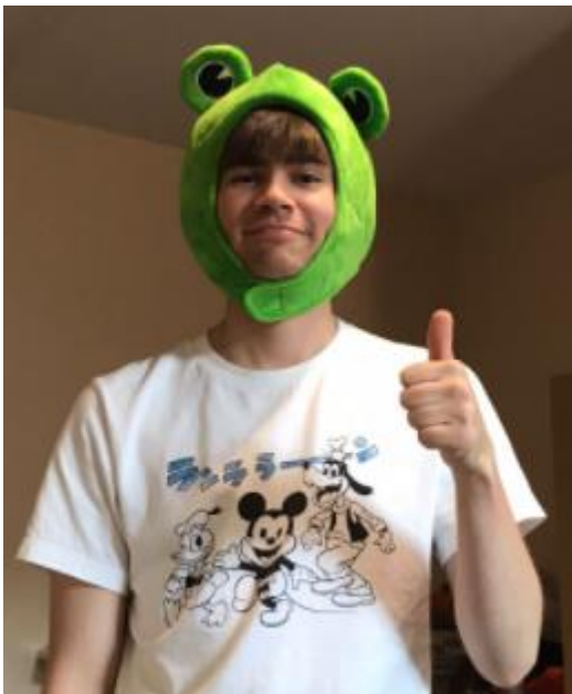
Figure 2 - the epitome of fashion

I'm friendly and approachable, so am always up for discussing points raised at the SU (which have the potential to impact a lot of people) in an open and comfortable manner.